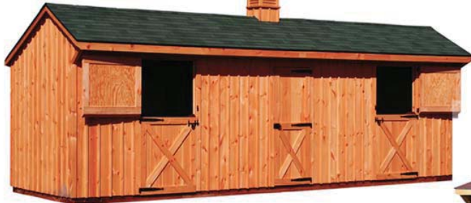
10'x32' Horse Barn with 2 10'x12' Stalls and 8'x10' Tack Room